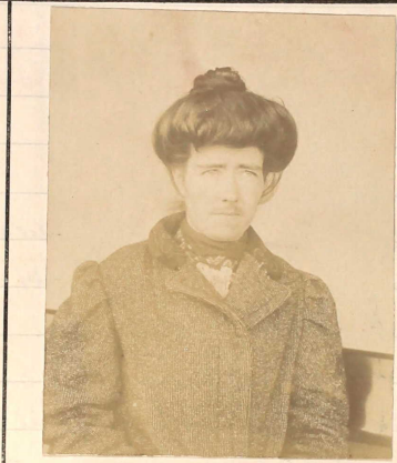
PHOTOGRAPH ON ADMISSION.